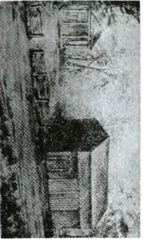
Col. Daniel Sayre Barn located on Lake Rd 1807