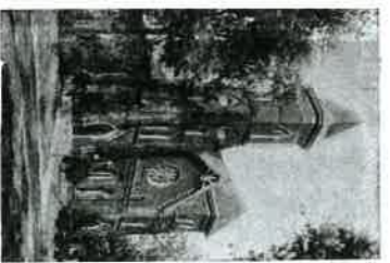
"Third" Church at current location 1871