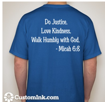
Bible verse that will be on the back of T-shirt