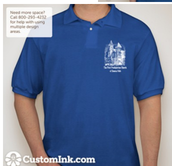
Polo Shirt is printed on front only